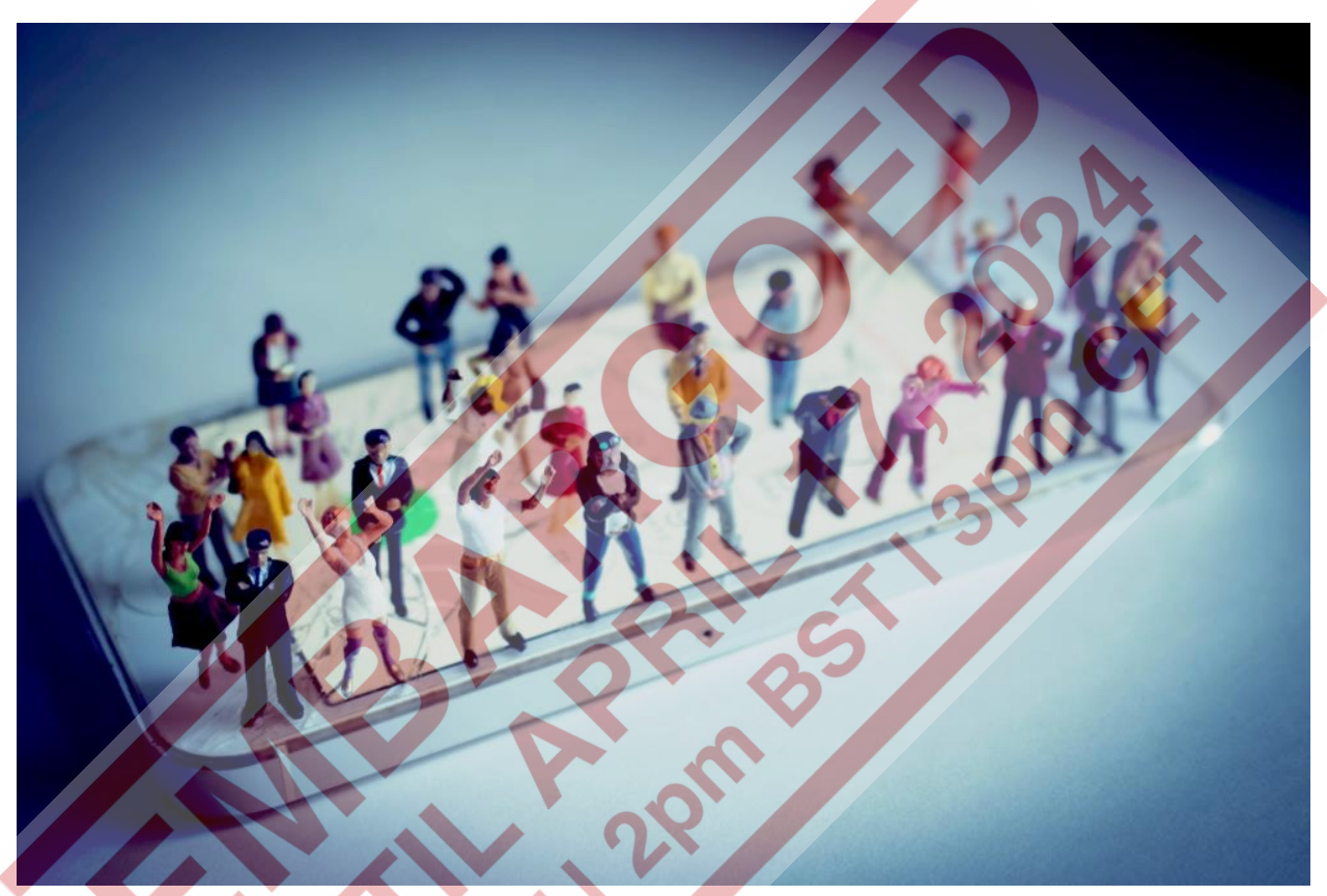
Share This Article

Why we need to tackle censorship and authoritarianism head on.